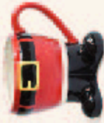
SANTA PANTS MUG (14oz) $18