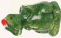
SANTAREX MUG (12oz) $20