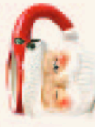
SANTA'S HEAD MUG (10oz) $15