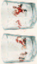
DOUBLE ROCKS GLASSES SET OF 2 (9.5oz) $20