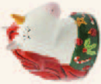
UNICORN MUG (12oz) $20