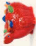
CHRISTMAS SAURUS MUG (12oz) $20